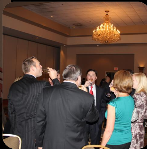
Celebrating a successful meeting.