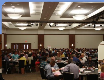
MILE mentors and protégés engage with one another on activities.