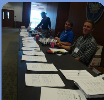
Waiting for MILers to arrive.