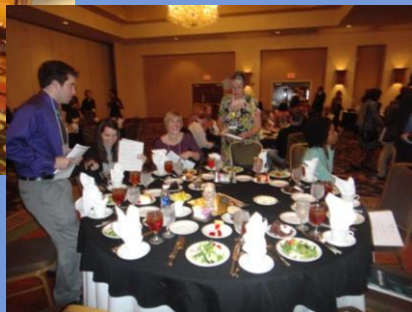
MILE mentors and protégés getting ready for a delicious dinner.