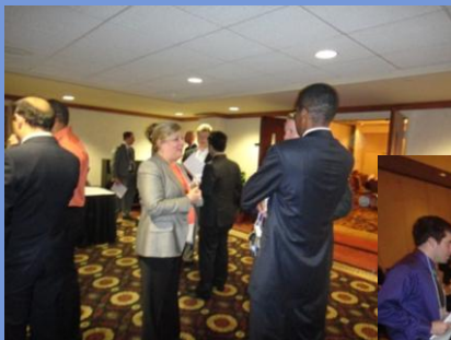
MILE mentors and protégés networking before the dinner.